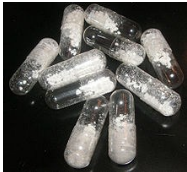
20mg Capsules of 20C-E

2C-E usually comes in the form of a white, scored tablet about the size of an aspirin. It can also be found in a white powder form that is snorted. Side effects can include nausea, paranoia, flashbacks, and permanent changes to personality and psyche.